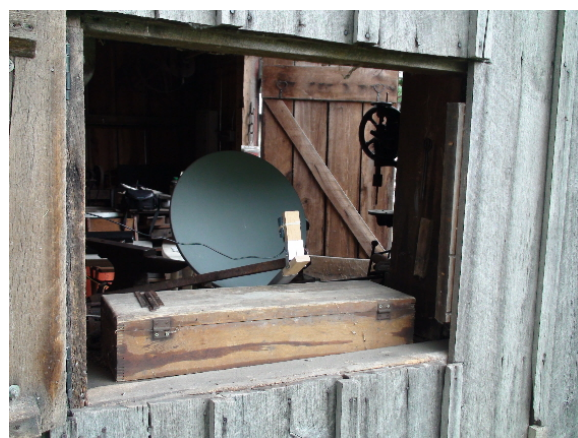
Bob (WB8QW)'s AREDEN node using old satellite TV dish