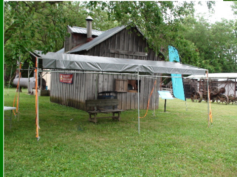
Portable AREDN setup with link to WCARES system on County Home Rd. tower Bob (WB8NQW)