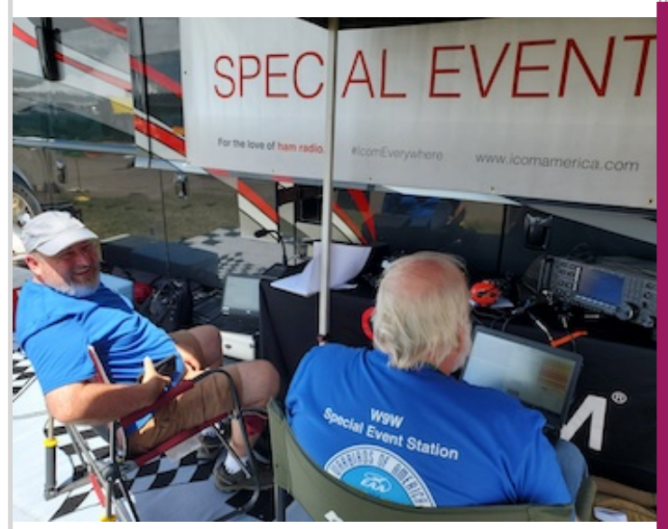
Operators at Oshkosh special event station W9W, one of two such stations at the site

See the ARRL Special Events database for further details about W9W and W9ZL.