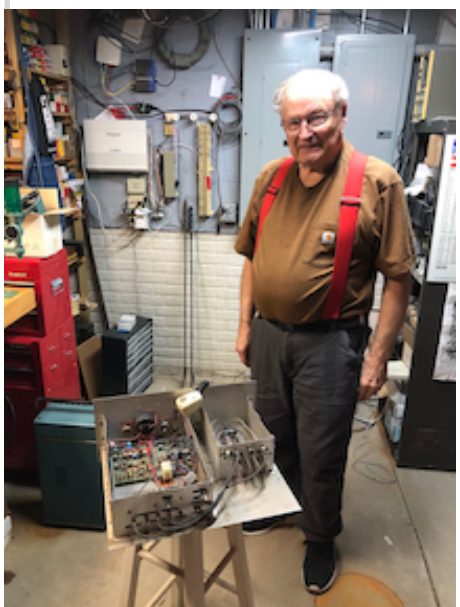
WB8NQW with the very first K8TIH repeater

Ham from p. 4 antennas without the benefit of duplexers, but after some experimentation, it was