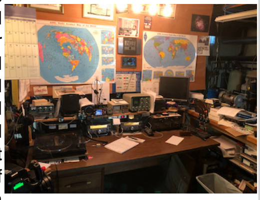
the vacuum Operating position at WB8NQW

needed for their operation. In his career, Bob experienced the evolution from the vacuum tube to the miniature solid state chip as the principal memory device in the computer. This trip took about 33 years, while at the same time leading to everincreasing miniaturization, until now there is almost as much or more computing power in the typical desktop computer, tablet or smartphone.