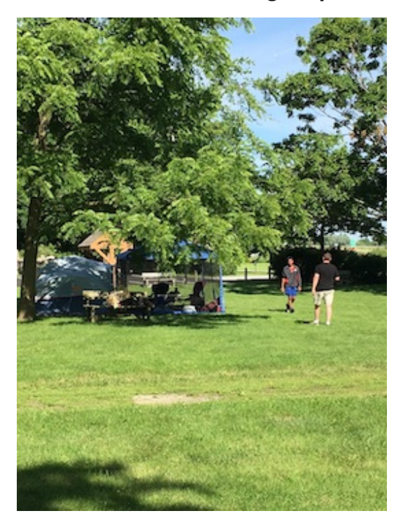
KD8NJZ-Eban and NM8W-Craig in front of their operating tent