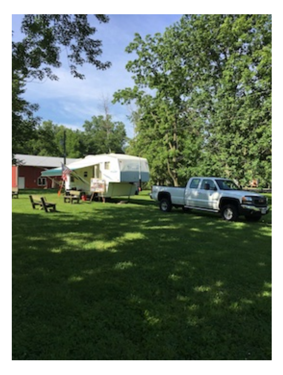
KE8CVA-Terry's operation center using dipole antenna