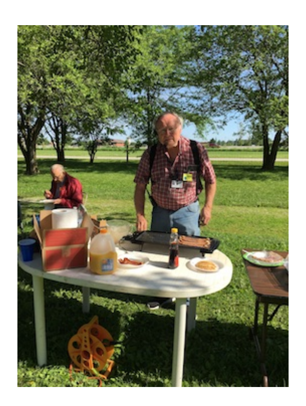
Master chef WB8NQW cooking flapjacks and bacon for breakfast