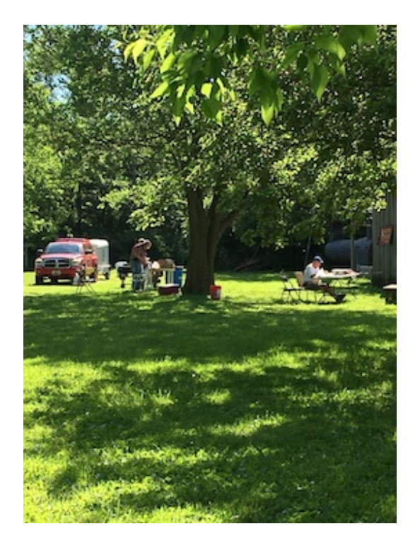
WB8NQW-Bob prepping breakfast N1RB-Bob on CW using loop antenna