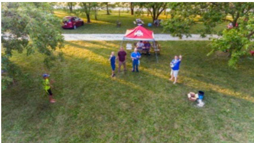
A wave from the ground. Eban-KD8NJZ (far left) is first mate in this operation.