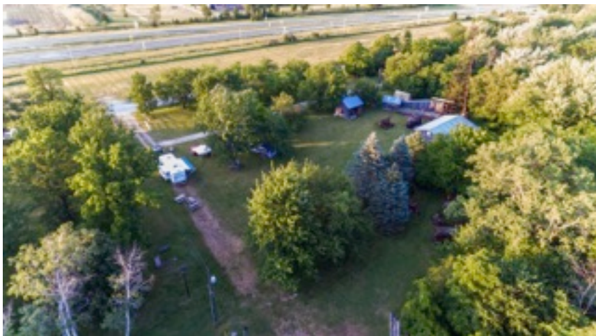
Drones can also take photos- aerial view of the entire WCARC Field Day operation (Rt. 6 above).