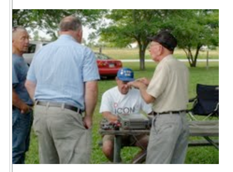
W8PSK making final feedline connections to the loop