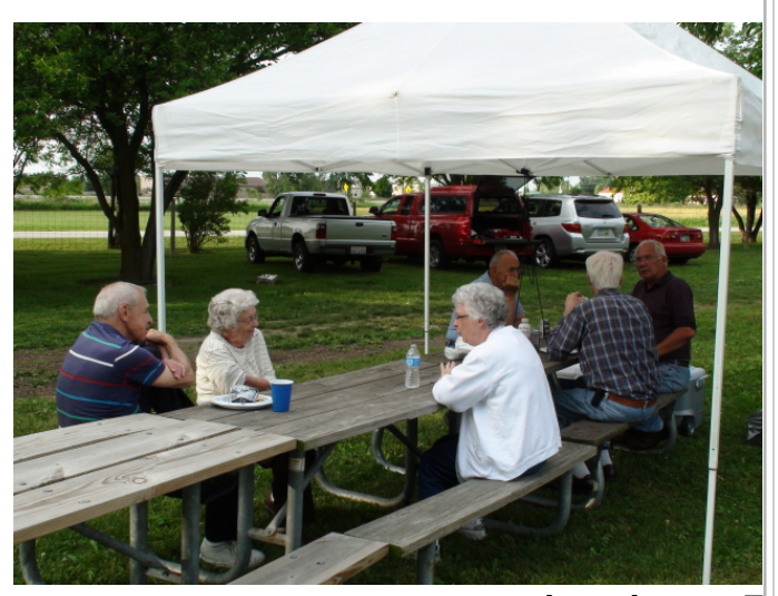
continued on p. 7