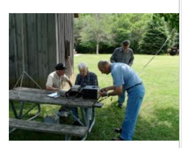
Well, I guess it's back to the microphone