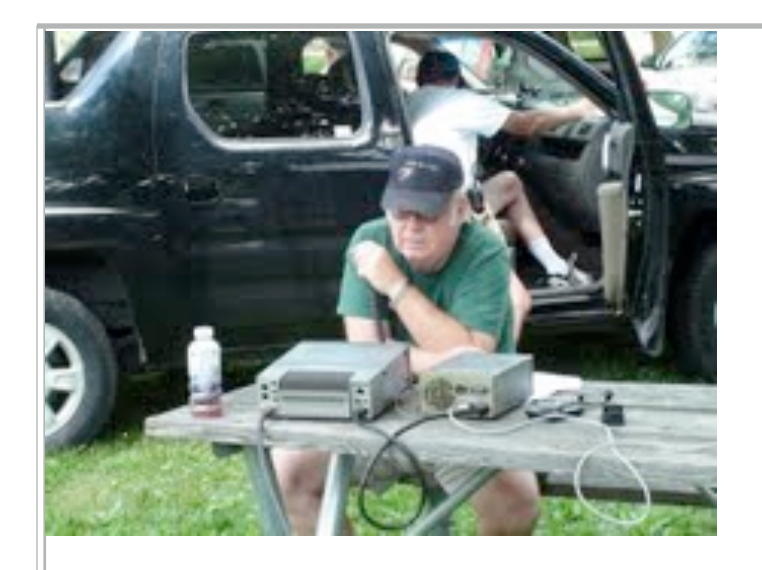
Club's Kenwood on 10m operated by KG8FL