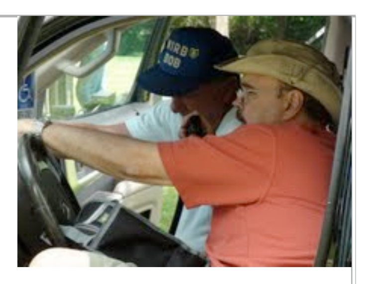
A chance for discussion of many topics