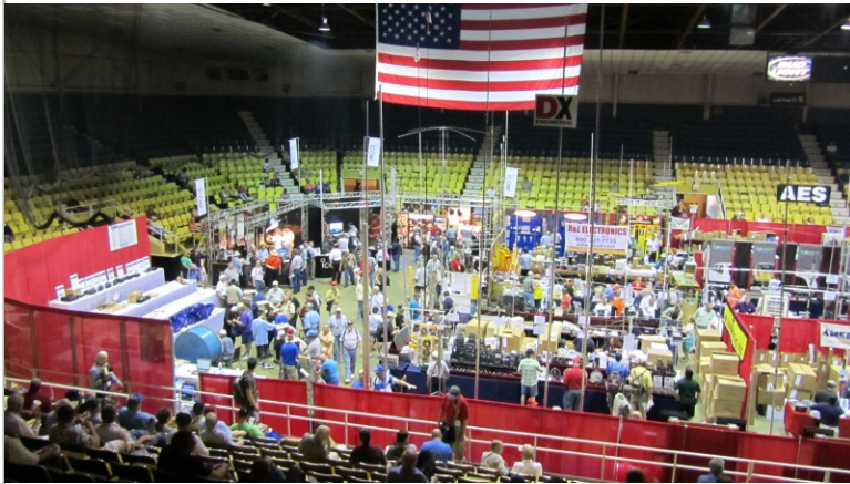
main floor-Hara Arena