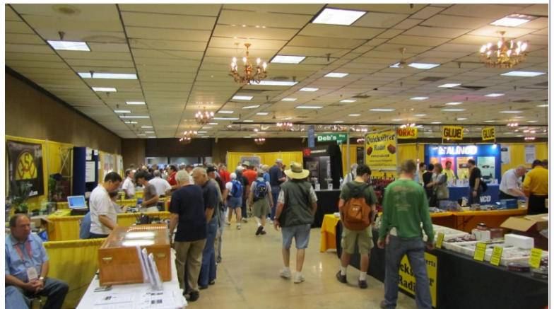
other inside vendors