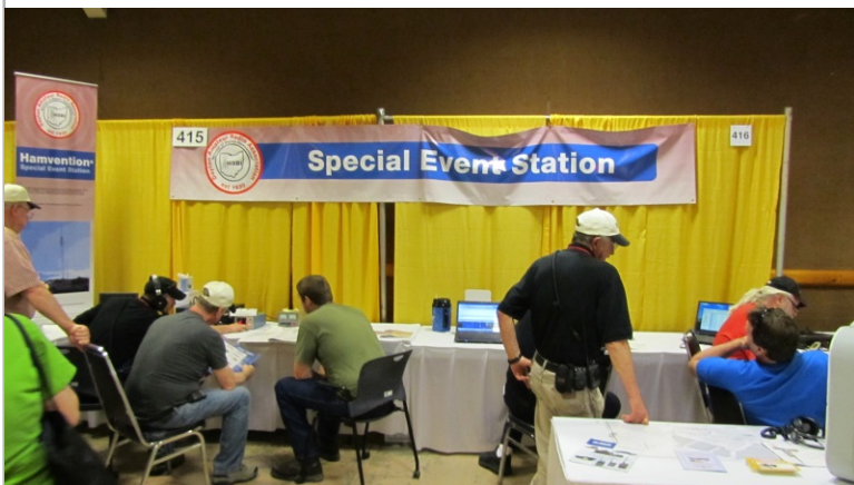
W8BI special event station