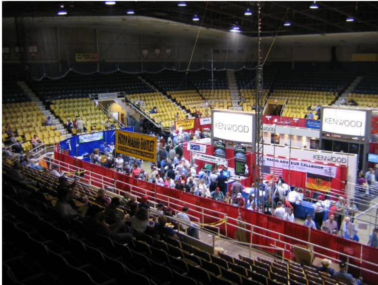
Main Exhibit Floor Hara Arena