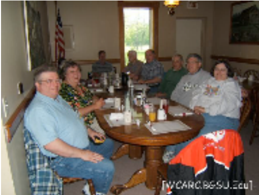
Main table at Cousin's