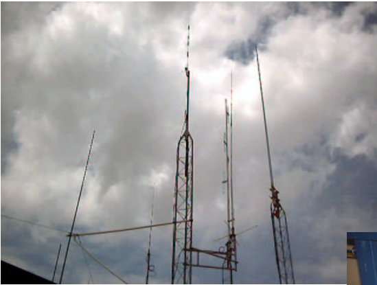
K8TIH Receiver Antennas