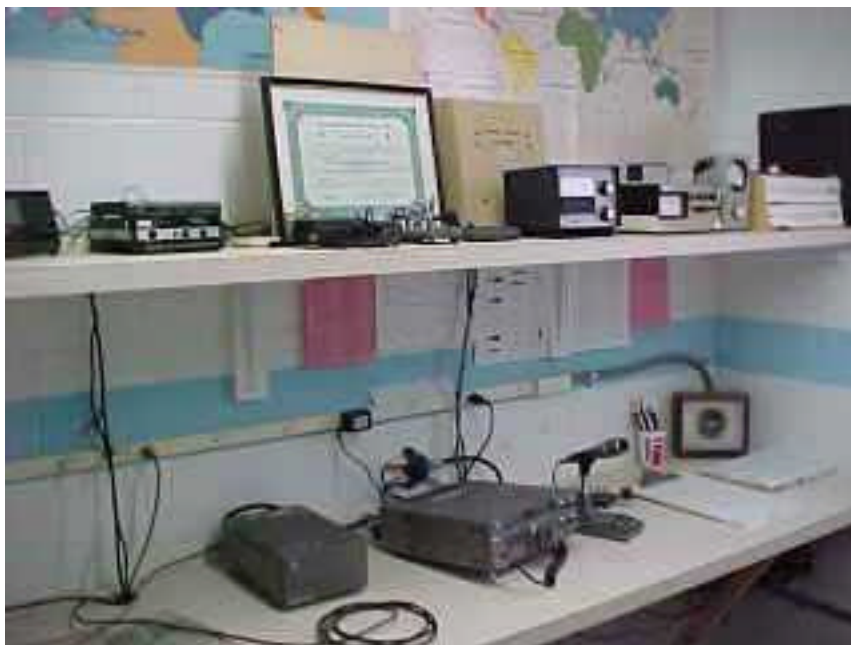
silent key plaque