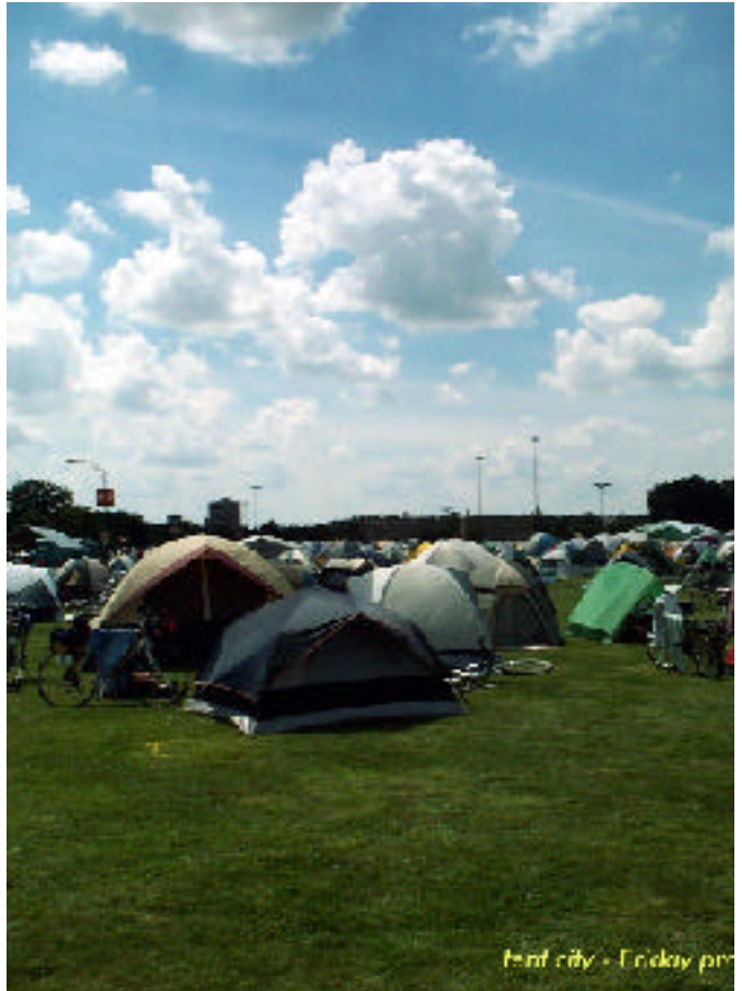
Our job was to be completed when the tour left Wood County. Unfortunately, due to some sort of snafu in Sandusky County, there were no ama-

teurs there who had volunteered to work the ride on Saturday! Several of our ARES members graciously volunteered to extend the coverage into Sandusky County. This was made quite easy because the 147.18 machine has good coverage over to Fremont and also because of N8DWR's fine set up. We were able to hit the Fremont 146.91 machine with ease from the comfort of his motor home as it sat parked in the BGSU parking lot!