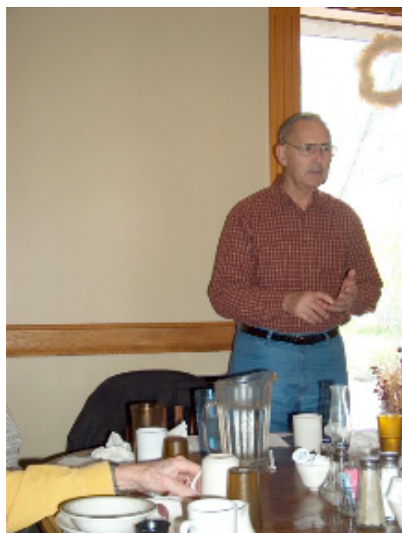
W8PSK giving an update on the latest BPL news in Bowling Green