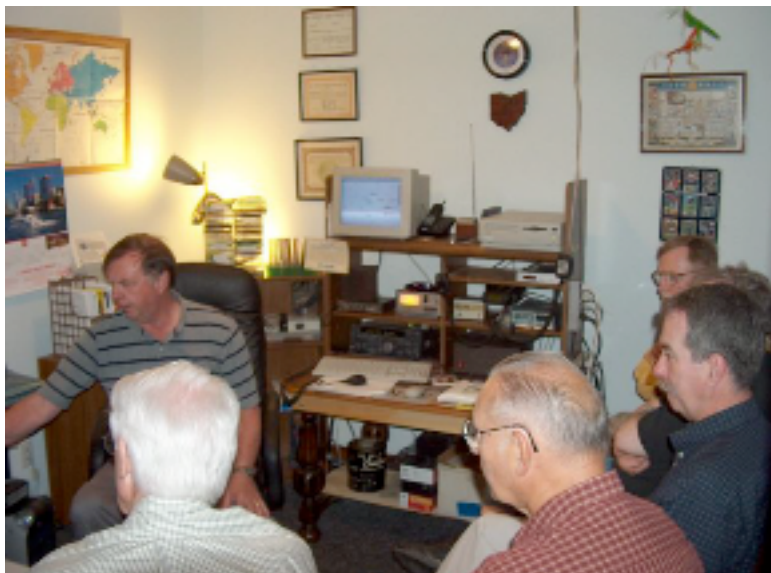
After breakfast---N1RB holding forth in his shack--topic is "the one that got away"